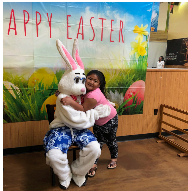
2019 Spring Carnival & Health Fair.